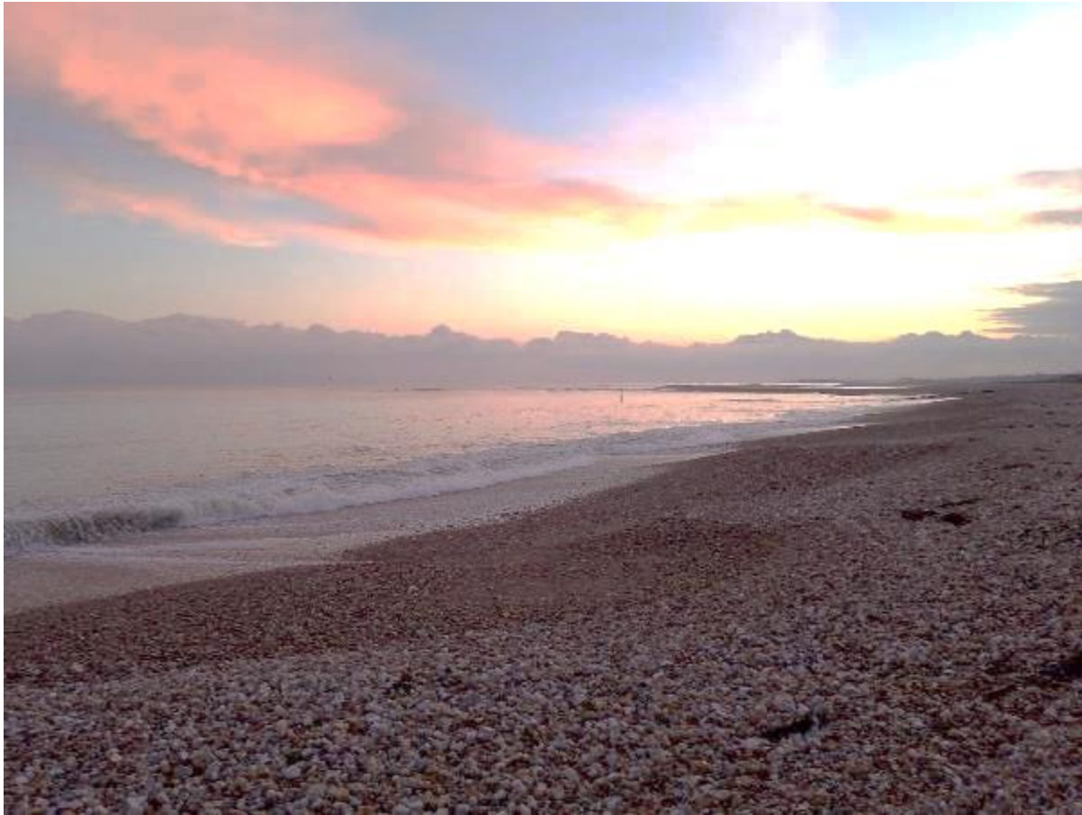
Red sky at night.....before the storm?