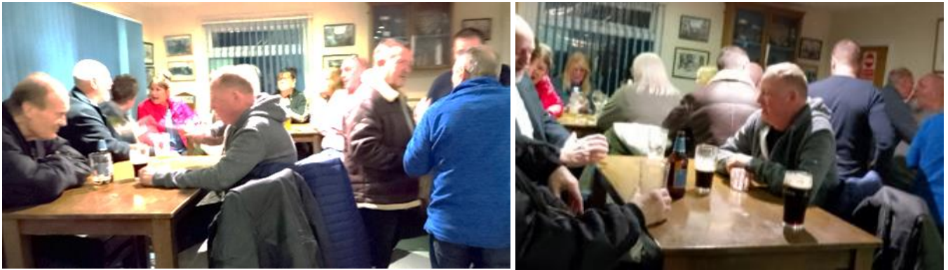
A really busy Sunday – once SSEN had managed to put the power back on after an unexpected early closure on Saturday.