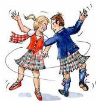
Scottish dress is optional